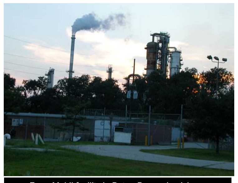
ExxonMobil facility in Baton Rouge, Louisiana.

On behalf of and in consultation with the Clinic's clients, the Clean Air Initiative targets toxic air pollution in Louisiana from industrial facilities, including oil refineries and chemical and petrochemical manufacturing facilities, which are overwhelmingly concentrated in low-income, minority communities throughout Louisiana. The Initiative's goals are to abate dangerous air emissions, deter industry violations of the Clean Air Act, and empower citizens to participate effectively in the permitting and enforcement processes. The Clinic worked on the following clean air matters during the 2004 - 2005 academic year: